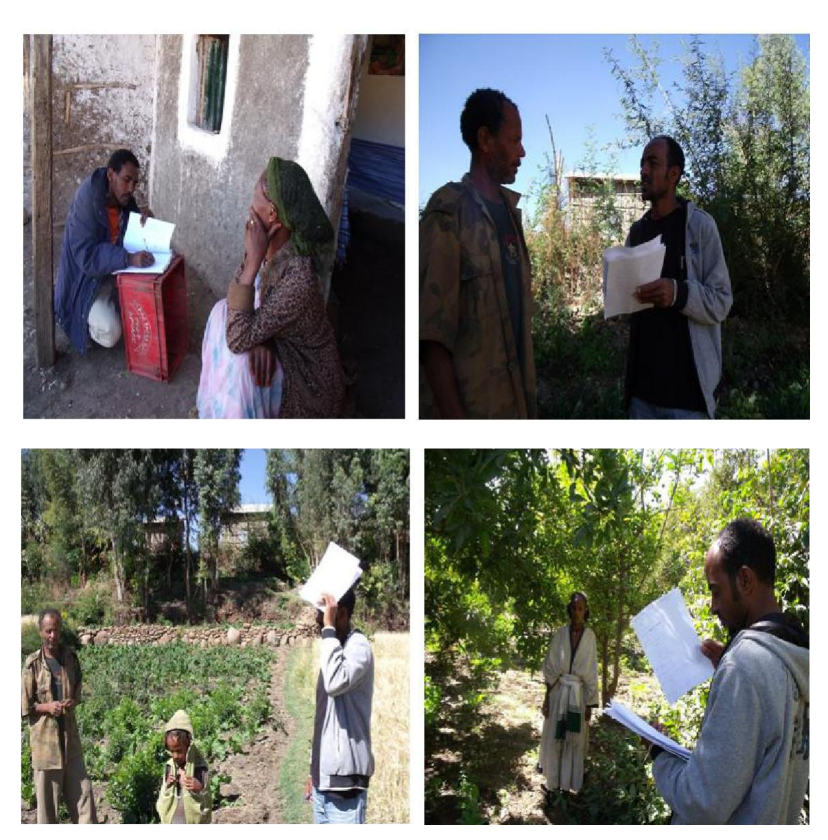
Appendix 3. Some photos during Interview with some of the respondent.