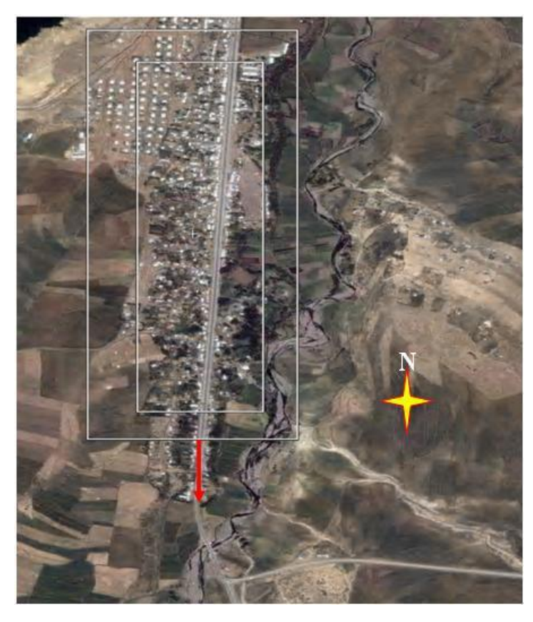
Appendix 1. Transect walk study used in the study area( red arrow indicates the way to Addis Ababa and rectangular white colored lines transect lines considered 500 m far from each other two along the river side and other two transects on the opposite side of the river that pass through Hiwane.