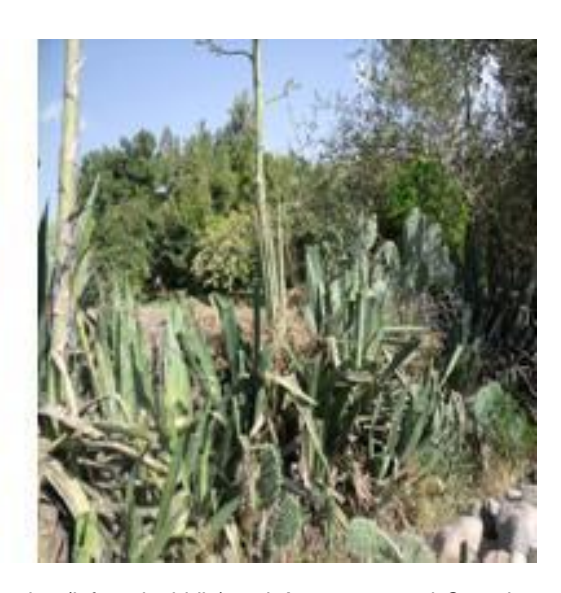
Figure 4. Shembaeta ( Rumex steudelii ) planted at water canals to protect bank erosion (left and middle) and Agave spp. and Opuntia ficus-indica on the outer margins as reinforcements for fences used in backyard (right).

construction material, as fuel wood ( E. globulus , Acacia etbaica ), sold as food ( Citrus spp, Carica papaya , Psidium guajava , Opuntia ficus-indica , Z. spina-christi , Persea americana , Mangifera indica ) or sold for making drink like Rhamnus prunoides (leaves are sold commercially for making beer and "siwa" (local drink)