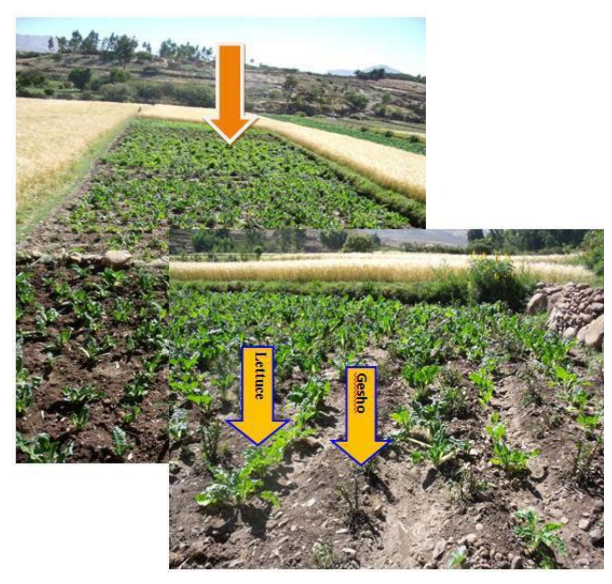
Figure 2. Partial Views of Wheat, Lettuce and Hop (Gesho) Agroforestry in Home Garden