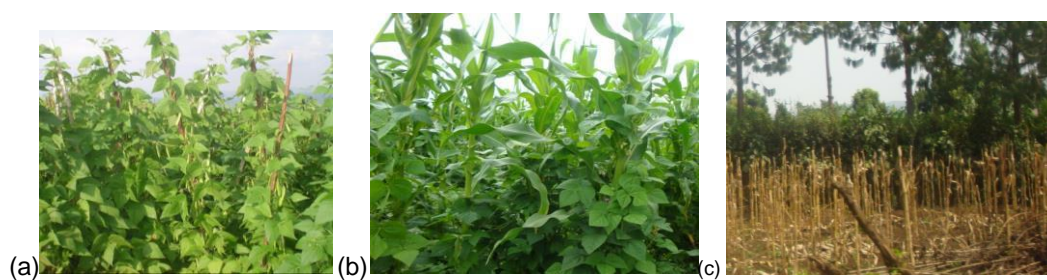
Figure 1: Staking climbing beans using (a) eucalyptus wood, (b) maize plants; (c) maize stovers ready to be used as stakes for climbing beans

Chi-square =109.77, df =5, p<0.001 ; Long term maturing trees ( Eucalyptus , Acacia mearnsii (black wattle); Shrubs ( venonia , dariya , Umukondogoro ); Agro forestry trees ( Calliandra calothyrsus , Sesbania sesban , Leucaena leucocephala , cypress ).