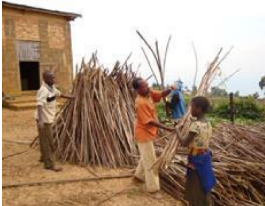
Figure 3: Illustration of piling upside down of stakes in preparation for storage after harvest

climbing bean production. Some of the measures implemented included staking immediately stakes are taken to the field to avoid theft. Some periodically monitor to ensure security of both beans and stakes or employ guards against thieves while the crop is still in the field. While others harvest and carry climbing beans up to home when still on the stakes which saves the stakes from both theft and wild fires.