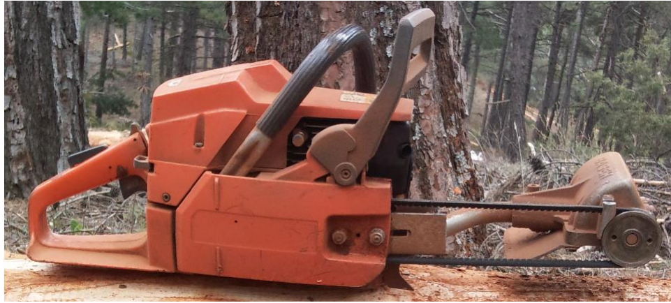
Figure 1. The general view of log debarker.

into a new tool as debarker to peel tree bark, produced by a variety of international and national firms, as well. It can be simply attached to any chainsaw and it manages into action as a log debarker. The power transmission is provided with the help of a strap (V-type) connected to the chainsaw drum gear. Made of various types of fasteners for chainsaws are mounted to the chainsaw body by removing the plate and closing the chain lubricating system (Figure 1). Assembly can be made directly to the body of chainsaw with the help of carrying handle of debarker attachment and/or to plate for low volume of chainsaw (Anonymous, 2010; BASEH, 2010; TrioAgri, 2010).