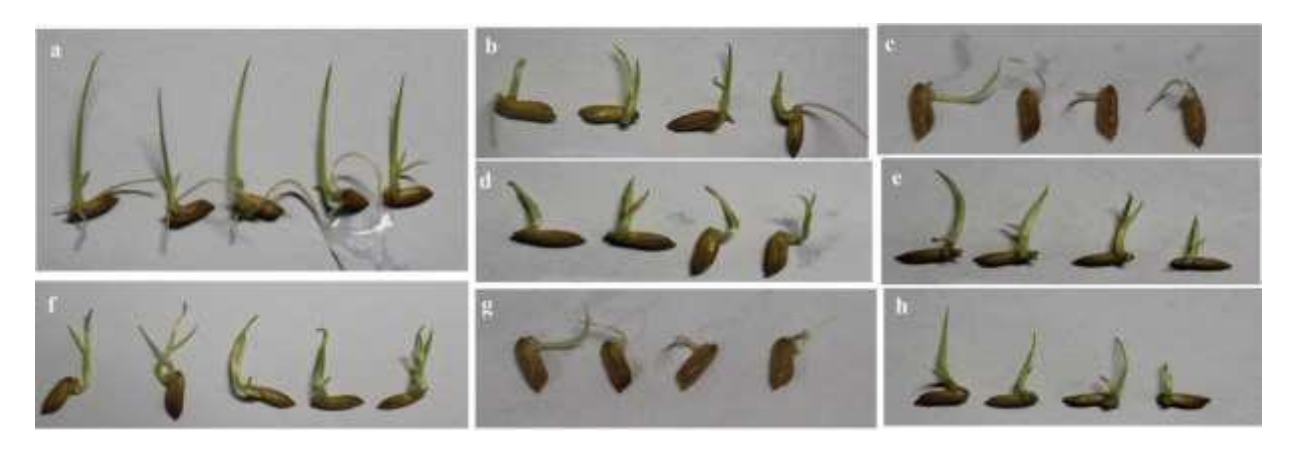
Figure 1. Effect of crude ustiloxins on the germ and radicle of '9311'. a. CK; b. UvZZ9-1; c. UvQL3-2; d. UvPJ1-1; e. UvWJ2-1; f. UvMY1-1; g. UvJT6-1; h. UvYA1-2.