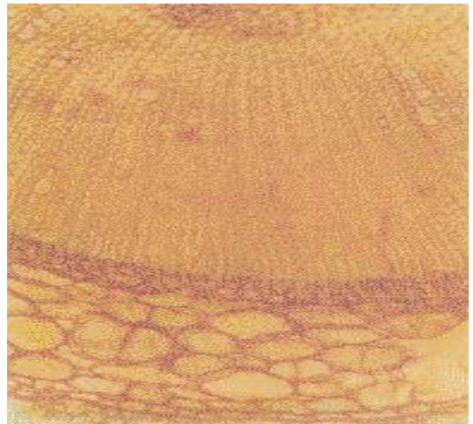
Figure 2. Transverse section of the roots of Solanum macrocarpum .

mm thick sections were made. The ribbons were placed on clean slides smeared with a thin film of Haupt's albumen, allowed to dry and drops of water added prior to mounting. The slides were placed on a hot plate at 40°C for few minutes for the ribbons to expand and were stored overnight. The slides were immersed in pure xylene for 2 – 5 min in a solution of xylene and absolute alcohol with 1:1 ratio (v/v) for few minutes. The slides were then transferred to another solution of xylene and alcohol in the ration 1:3 (v/v) for few minutes,