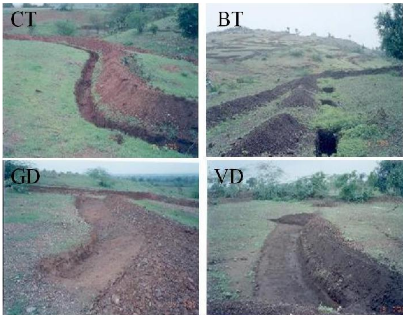
Figure 2. Rainwater harvesting devices applied under afforestation in degraded Aravalli, Rajasthan, India. CT, contour trench; BT, Box trench; GD, Gradonies; and VD, V-ditch.

0.40 cm collar diameter were planted in a pit of size 45 × 45 × 45 cm. There were three slope categories that is, <10% slope, 10-20% slope and >20% and five rainwater harvesting treatments plots replicated five times (distributed in about 17 ha area) to provide 75 plots.