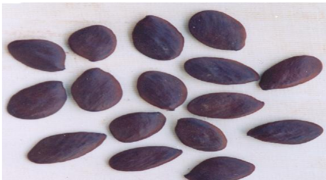
Plate 1. The seeds of Pentaclethra macrophylla .

ries and their potentials in overcoming or ameliorating prevailing food problems are enormous (Getahun, 1974; Okafor, 1980a, 1980b, Okigbo; 1997). In many cases there is no clear cut between food and medicinal plants. Many edible plants from the forest are also used in traditional medicine, e.g. Pterocarpus spp, Vitex doniana , Garcinia kola which are reputed as poison antidote are also used in the treatment of coughs and hepatitis (Iwu, 1987).