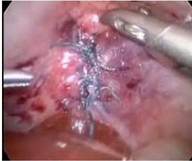
Figure 3. Intraoperative picture showing the centrally located anterior diaphragmatic hernia pre and post repair.

elective post-operative mechanical ventilation for 3 days and subsequently, extubated and discharged home in good general condition. He is now one year following surgery, well and gaining weight.