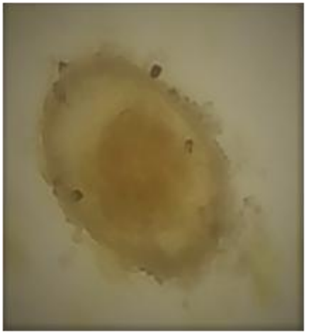
Plate 1: Photomicrograph of A. lumbricoides.