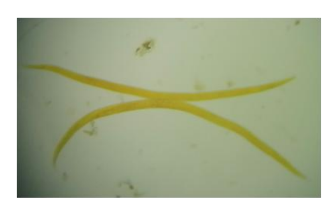
Plate 2: Photomicrograph of larvae of S. stercoralis.