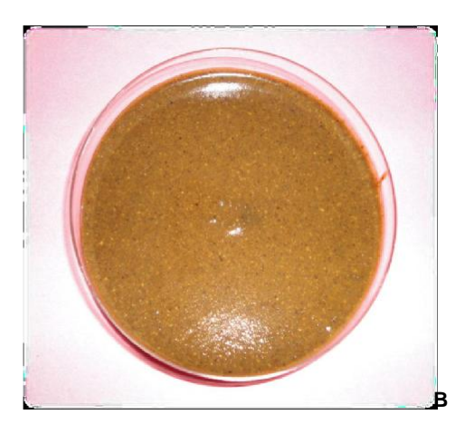
Figure 2. Effect of Sea-Qust on the growth of Staphylococcus aureus bacteria. (A): Control culture. (B): S. aureus culture with 15% Sea-Qust powder.