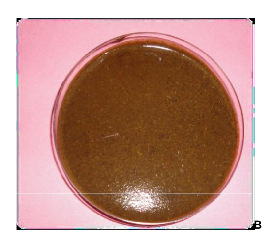
Figure 1. Effect of Indian Costus on the growth of Kelbsilla pneumonia bacteria. (A): Control culture; (B): K. pneumonia culture with 20% of Indian Costus powder.