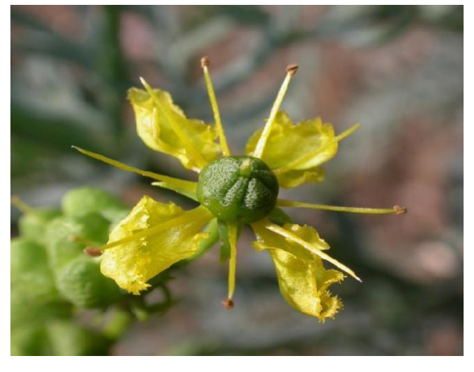
Figure 3. R. graveolens flower.

women because in high concentrations it can provoke hyperemia in the uterus and high mobility (oxytocic action) which may cause abortion. At the concentrations needed for this effect, it can cause the death of a pregnant woman. R. graveolens is rich in rutin which act as a venotonic and capillary protector. Rutin helps increase visual sharpness and benefits other visual problems, and it was used against edema, thrombogenesis, inflammation, spasms, and hypertension (Miguel, 2003). The essential oil is spasmolytic, antiinflammatory and antihistaminic and is a vermifuge (Mansour et al. 1989). R. graveolens can also be used as a rubefacient, applied in poultices for rheumatic pain, dislocations, tendon strains, varicose veins and skin conditions such as psoriasis and eczema. It has bitter eupeptic properties, so it is prescribed for stomach and intestinal disorders. If externally spread on moist skin under direct sunlight it leads to photosensitivity, caused by furanocoumarins resulting in hyper pigmentation, swelling, itching, and even burns and blistering (Miguel, 2003).