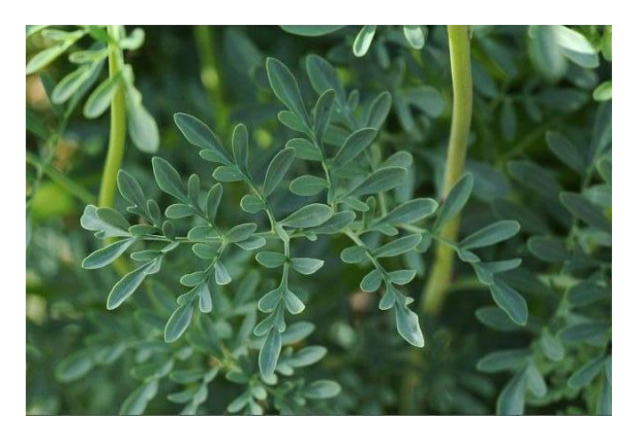
Figure 2. R. graveolens leaves.