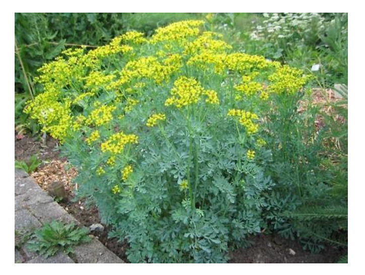
Figure 1. Ruta graveolens (Rue).