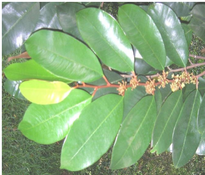
Figure 1. Chrysophyllum cainito L. (Sapotaceae): a part of the stem with simple, entire, acuminate leaves, yellow flowers joined together in axillary fasciculi. Authenticated by Professor Aké-Assi Laurent, Laboratory of Botany, U.F.R. Biosciences, University of Cocody-Abidjan (Côte-d'Ivoire). Samples of the plant are preserved in the Herbarium of the National Center Flora (C.N.F): Man, 20 July 1965, AKÉ-ASSI 8145; Abidjan, Botanical Garden, 8 February 1991, AKÉ-ASSI EMMA 26; Agboville, 27 February 2006, N'GUESSAN KOFFI N°345.

experimentally study the effect of the total aqueous extract of the plant's leaves on the glycaemia of diabetic rabbits in order to provide scientific evidence of the effectiveness of the traditional use of C. cainito , as antidiabetic.