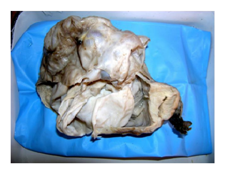
Figure 1. Gross photograph showing multilocular cyst adherent to the wall of uterus and cervix on right side.