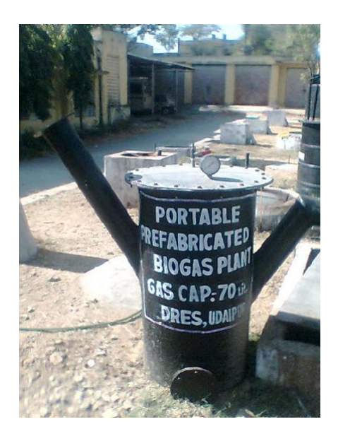
Figure 2. Prefabricated plant for laboratory study.

Laboratory study was then carried out in a continuous type fiber glass biogas plant (capacity = 70 L) charged initially with 80 kg of cattle dung slurry (1:1) to study slow replacement of cattle dung by Jatropha oil cake. The experiment was performed in triplicate. The Jatropha cake was presoaked in water (for one day) to prepare homogeneous slurry with water. Daily charging was done at the rate of 2 kg per day. The study of the plant was done for one year for shifting the technology to the field. The biogas was being tested for its flammable character (Figure 2).