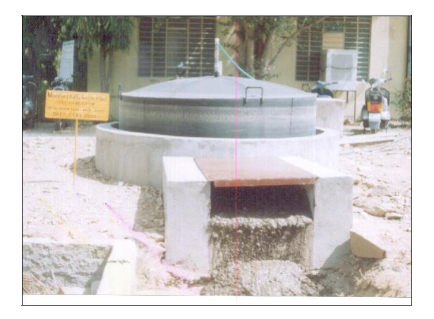
Figure 4. Jatropha based biogas plant (floating drum type).

biogas plant which crawled to 180 l/kg dm in control fed on cattle dung slurry. Similarly, biogas production decreases in winter season when the mean temperature is lower (8 - 12°C). During winter period of 2007, the gas production decreases from 230.6 l/kg dm in October to