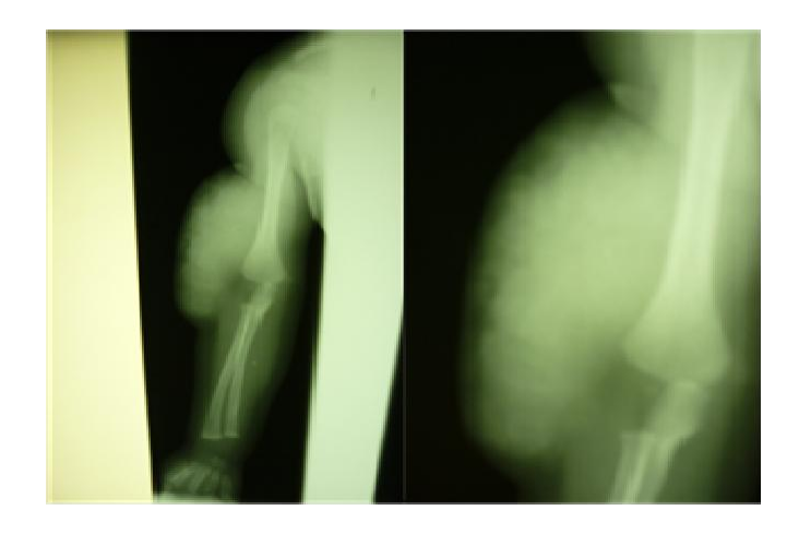
Figure 2a. Plain radiographs showing intramuscular haemangioma and intact bones