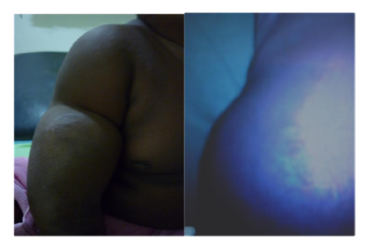
Figure 1 . Physical appearances of intramuscular hemangiomas involving the right arm and right abdominal flank respectively.

sonographic correlation especially in the newborn remains poor and scarcely reported.