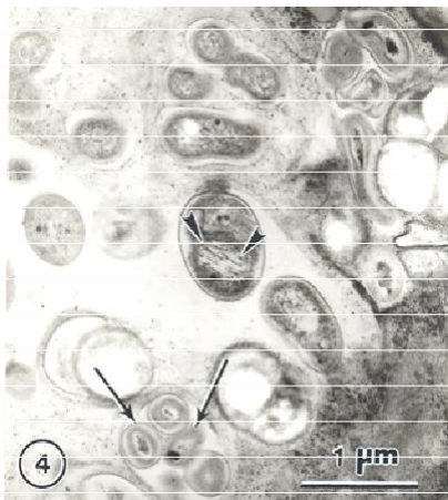
Figure 4. Adhesion of bacteria, probably a result of mucilage surrounding the cells (arrows). Note spiral arrangement of membranes within some bacterial cells (arrowheads).

bacteria, which occur either singly or in colonies.