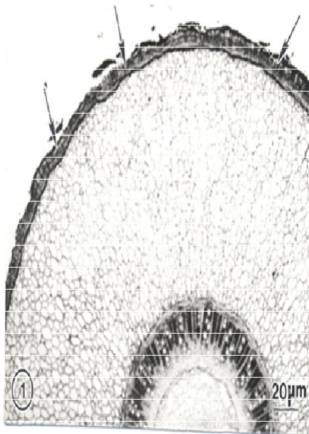
Figure 1. Transverse section of segment of pneumatophore of A. marina , showing damage to outer wall layers of cork sheath (arrows).