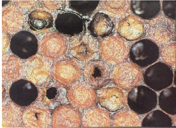
Figure 1. Characteristic appearance of the capping.