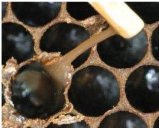
Figure 3. Rotten dead larva.

sticky (Figure 3). Bacteriological examination confirmed presence of spores and vegetative rods of P.larvae (Figure 4).