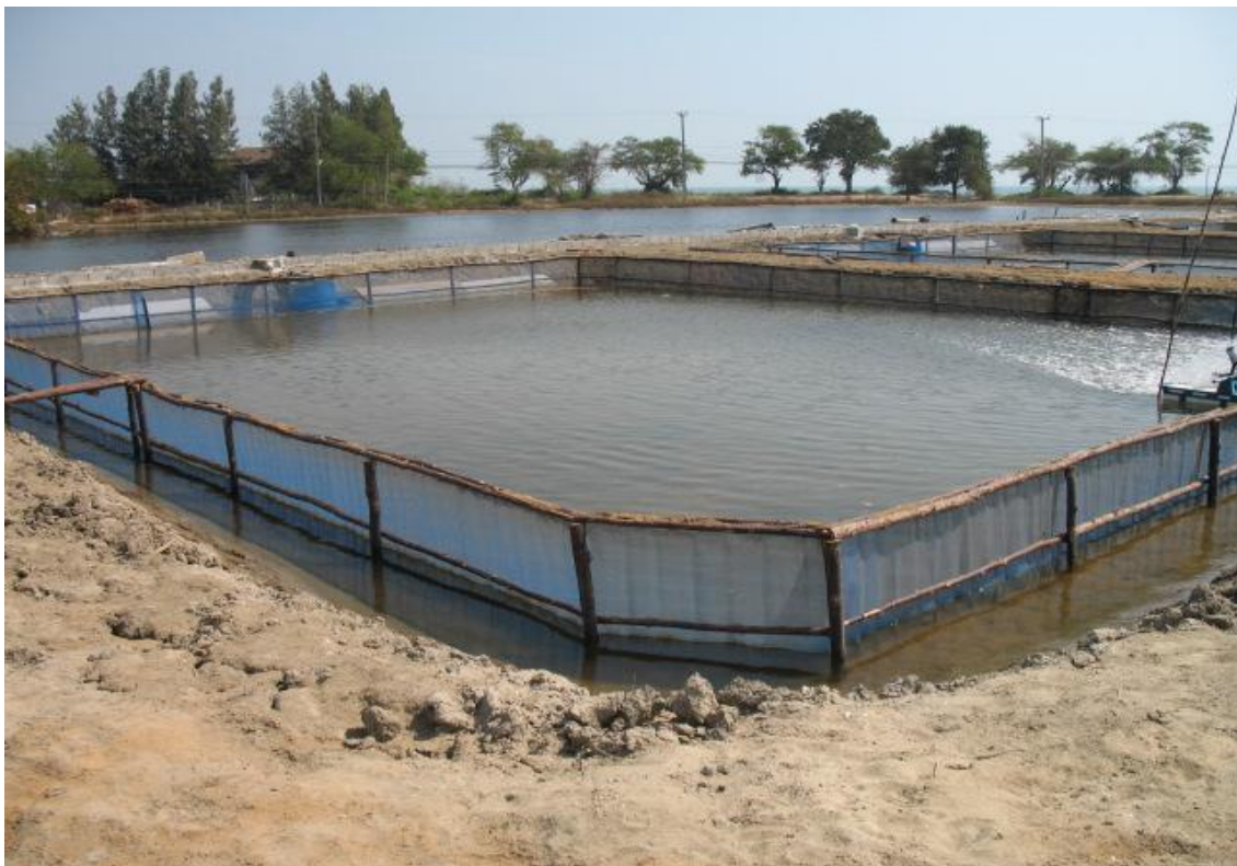
Figure 2. Grow out of B. areolata to marketable sizes using large-scale earthen ponds of 20.0x19.0x1.2 m.