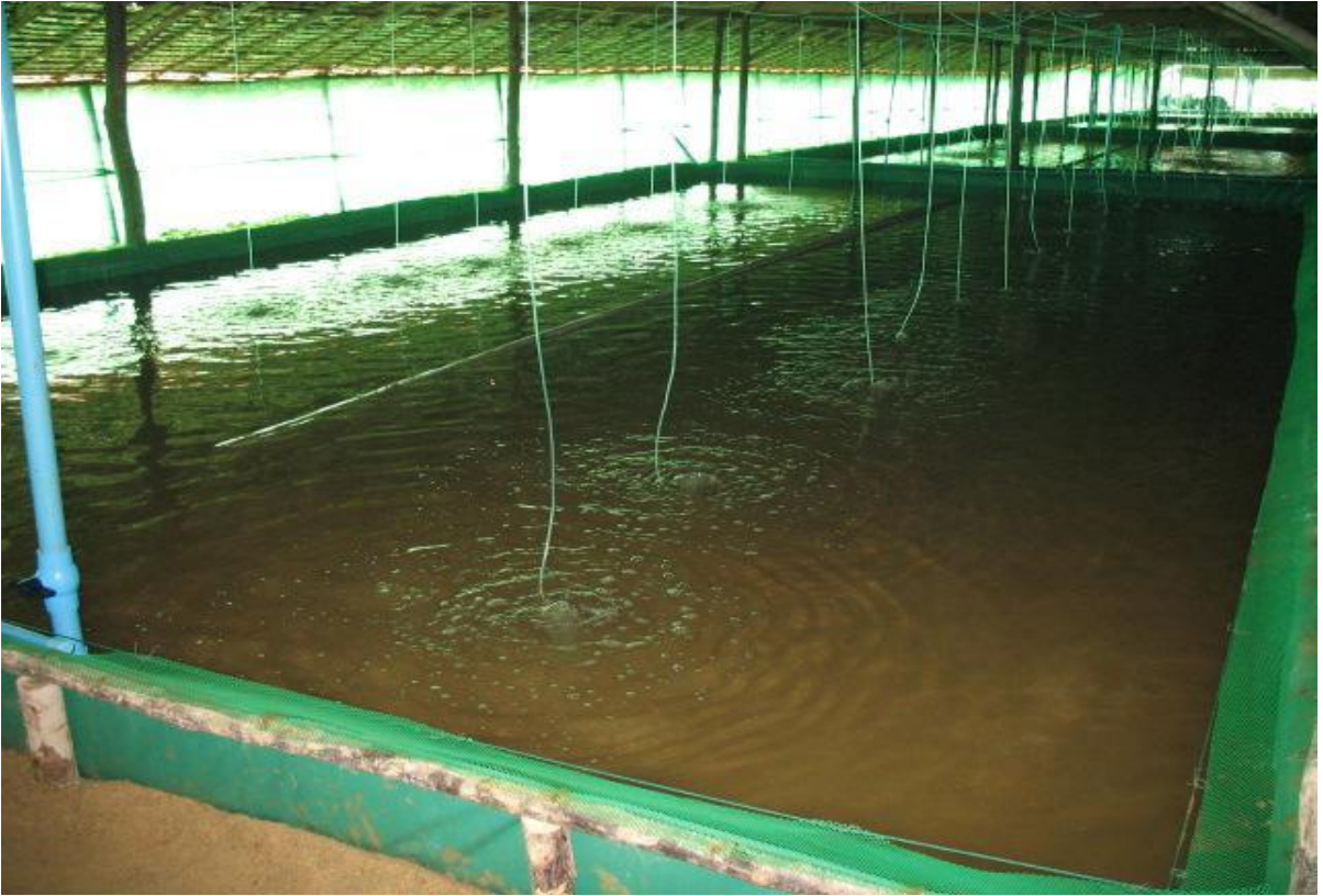
Figure 1. Grow out of B. areolata to marketable sizes using large-scale flow-through canvas ponds of 6.0x12.0x0.4 m.